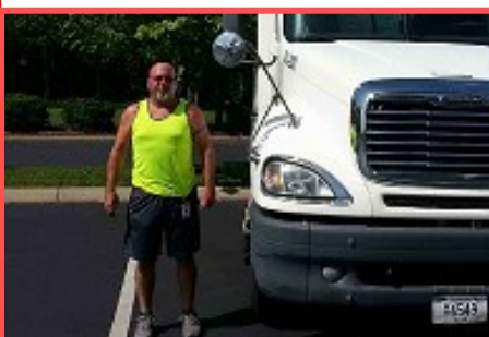
J. Carlisle NAS Branch

The holiday weekend will present our drivers with all of the usual driving hazards such as distracted drivers, heavy traffic, etc. Always put safety first in every aspect of your daily activities. Have a happy and safe Labor Day holiday!